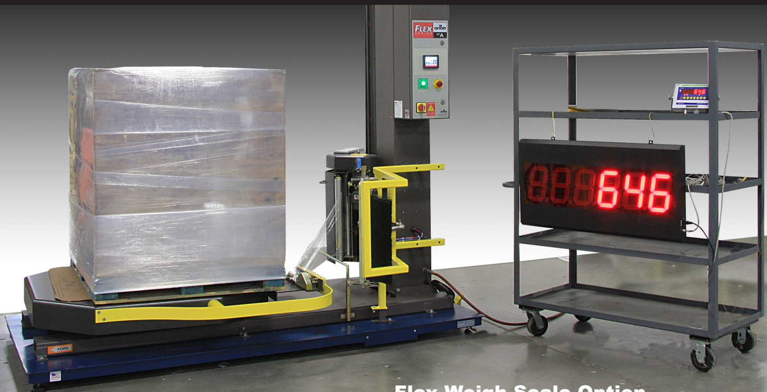
Flex Weigh Scale Option