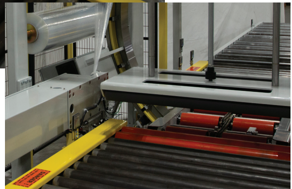
RIGHT: Hold-down platen ensures the load remains stable during wrapping

SCAN or CLICK. See Orion's orbital wrappers in action.