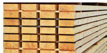
Lumber and Flooring