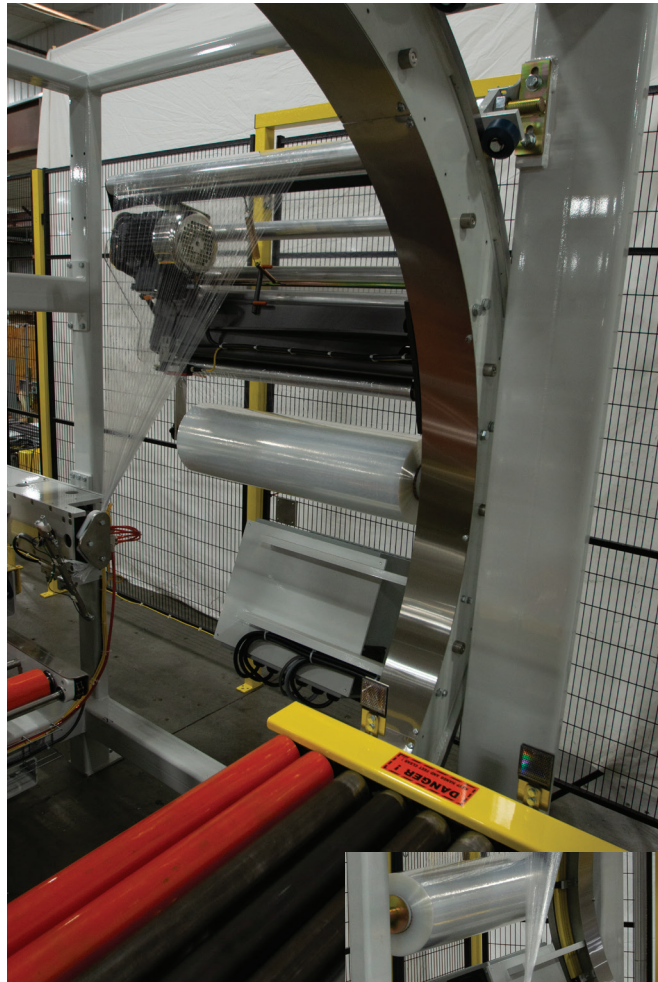
TOP: Film shown threaded and ready to wrap

Unique powered bridge conveyor is customized based on your product shape, size and weight.