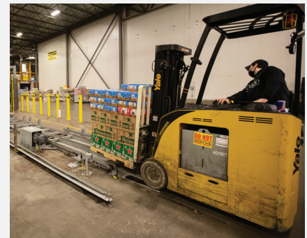
FOUR INCH PASS HEIGHT ALLOWS FOR UNIVERSAL LOADING WITH FORKLIFT, WALKIE, OR PALLET JACK.

"The MA-DX LoPro Drag Chain gives Origlio Beverage the ability to reduce their material handling time by being able to drop off two pallets at the same time... we were able to rework their operations processes to a single point of access, which reduces the number of touch points for each pallet."