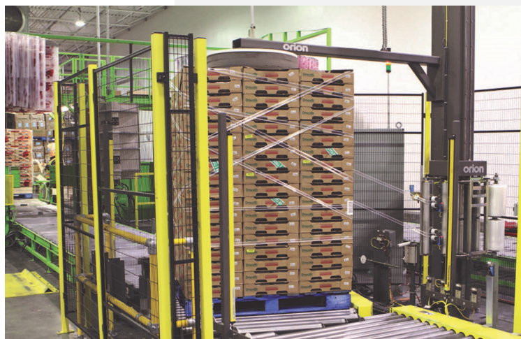
The top platen applies stabilizing pressure to the load as the X-shaped open wrapping pattern of film is applied.

Another adjustment made with the benefit of experience was in the gauge of the wrapping film. Orion and Associated Packaging began by recommending 80-gauge film, but Driscoll's subsequently found that lighter gauges worked just as effectively and reduced film cost. It is currently using 60-gauge film in its operations, which further reduces its pallet wrapping costs.