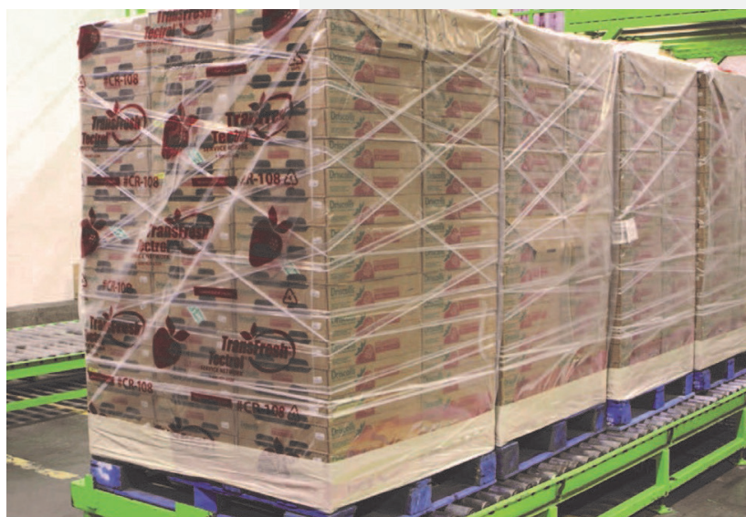
Banded loads sealed with modified atmosphere hoods await transfer to refrigerated trailers for their cross-country trip.

Make sure every load is safe and secure during its journey to market with Orion, the leader in heavy-duty industrial stretch wrapping technology. Orion is the industry's leading manufacturer and worldwide distributor of automatic stretch wrapping machines and semiautomatic stretch wrapping equipment, including rotary turntables, rotary towers, and horizontal wrapping systems. As part of the ProMach End of Line business line, Orion helps our packaging customers protect and grow the reputation and trust of their consumers. ProMach is performance, and the proof is in every package. Learn more about Orion at www.OrionPackaging.com and more about ProMach at ProMachBuilt.com .